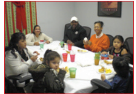
SMO Employees and Family enjoy a holiday meal