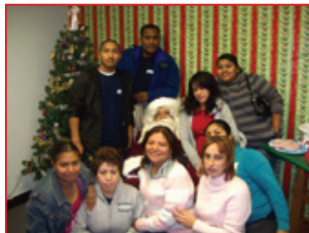
The RFMD Crew with Santa Claus