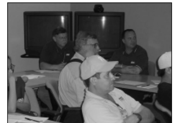
Class members pay close attention