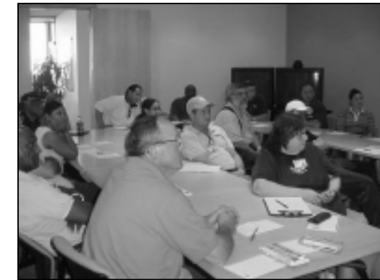
Train The Trainer Class