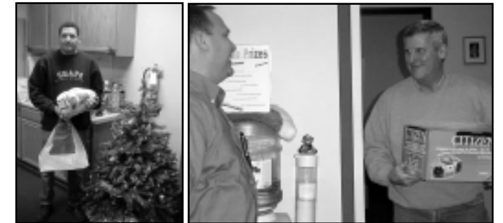
2002 Turkey Giveaway

SMO is planning its Third Annual Christmas Turkey Give-Away for Thursday, December 18 2003. Eligible employees are invited to stop by the SMO office between 2:00 and 6:00 pm to pick up your turkey. We will be serving refreshments and will have a door prize drawing every 30 minutes. Pay checks will also be available for pick up during this time. Please make plans now to come by, as we will not be able to give your turkey to someone else or keep it over night. If you any questions, please call the SMO office.