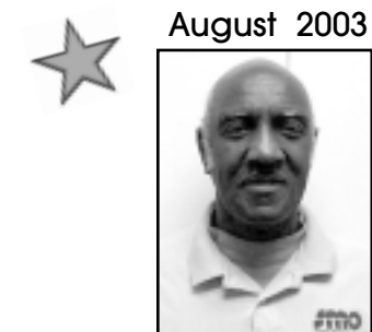
Paul Cathcart Friendly Center Office Building